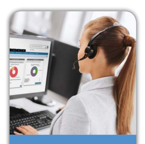
"Seconds are wasted by Agents looking up knowledge that already exists"

This issue is not industry or sector specific either. From large technology companies through to midrange companies, many IT departments think that it would be cheaper to build their own without considering the ongoing maintenance costs that this will incur. The costs are not limited to the development, testing and maintenance but also the need to retain expertise to support it, which carries a financial cost, not to mention the lack of sophistication required to ensure that knowledge is easy to find and share through a natural language search. Using technology containing a Natural Language Search allows not only each agent to use their own words, but ultimately allows the knowledge base to be utilised by each customer in a web self service or social/personal portal environment.