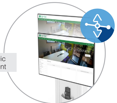
Gravity or electric height adjustment