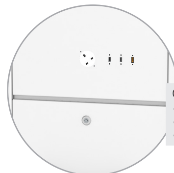
Customisable connectivity • USB • HDMI • 13A socket • Aperture for control panel